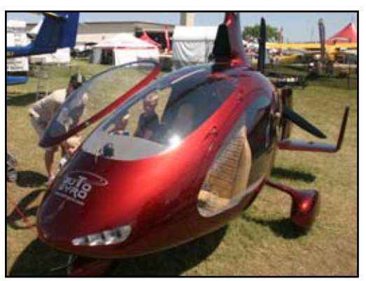
The Cavalon from AutoGyro GmbH