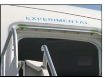
Now that's an experimental