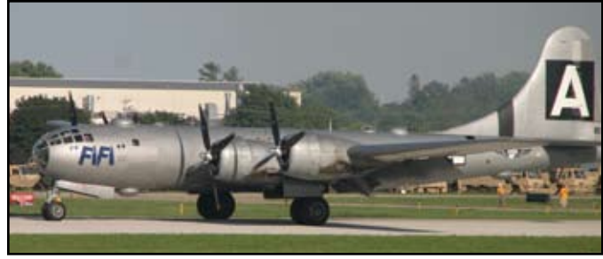
"FiFi," the world's only flying B-29 Superfortress