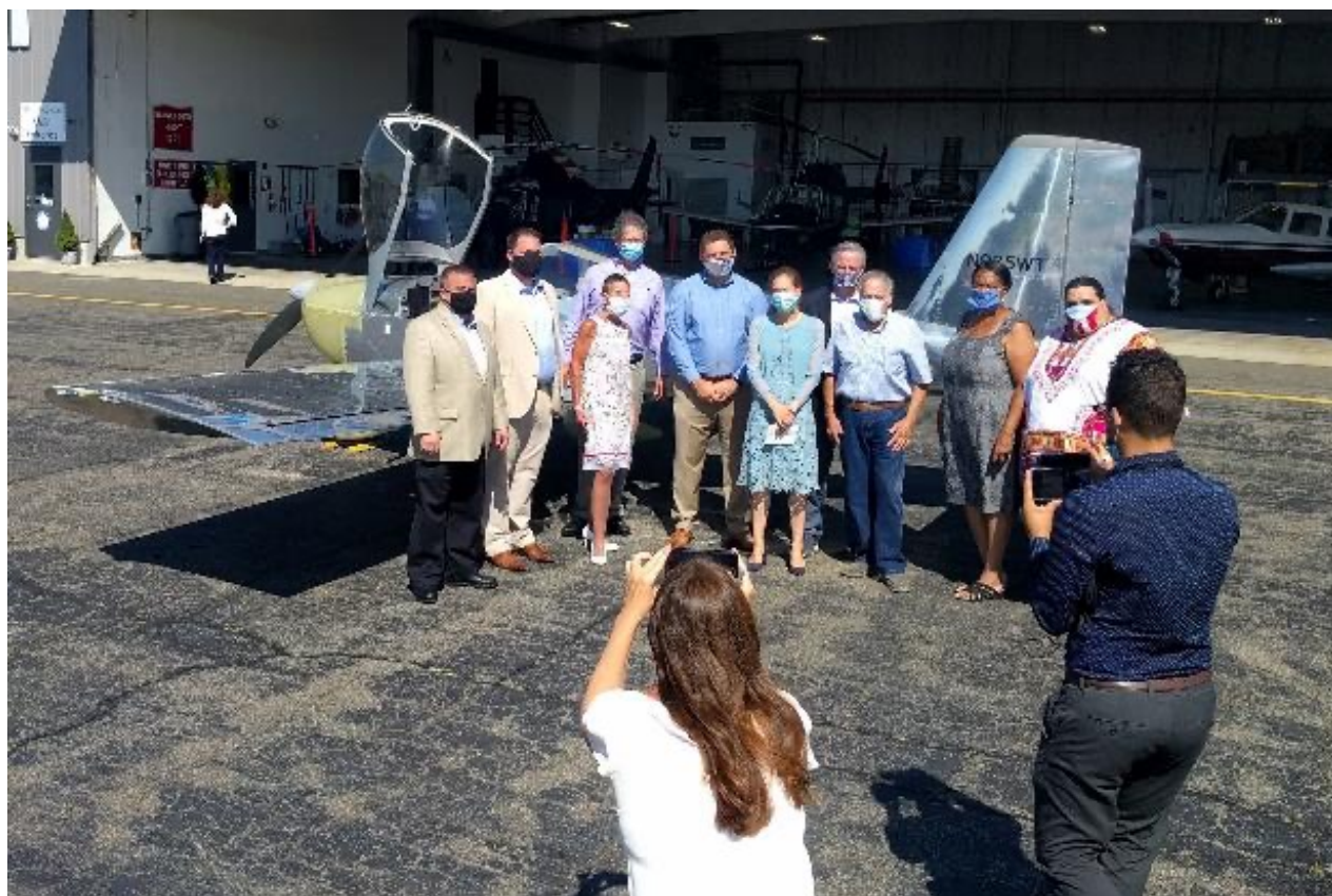
Bridgeport Tango Flight Kickoff