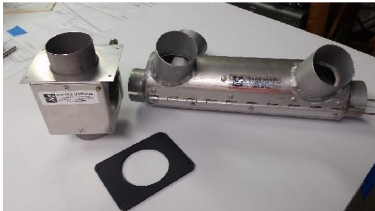
New/unused London & Associates Heat Muff and Fire-wall Airbox with Valve

Various lengths of two inch air hose, both high temp and low temp