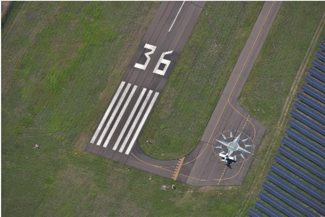
MMK Ninety-Nines Compass Rose