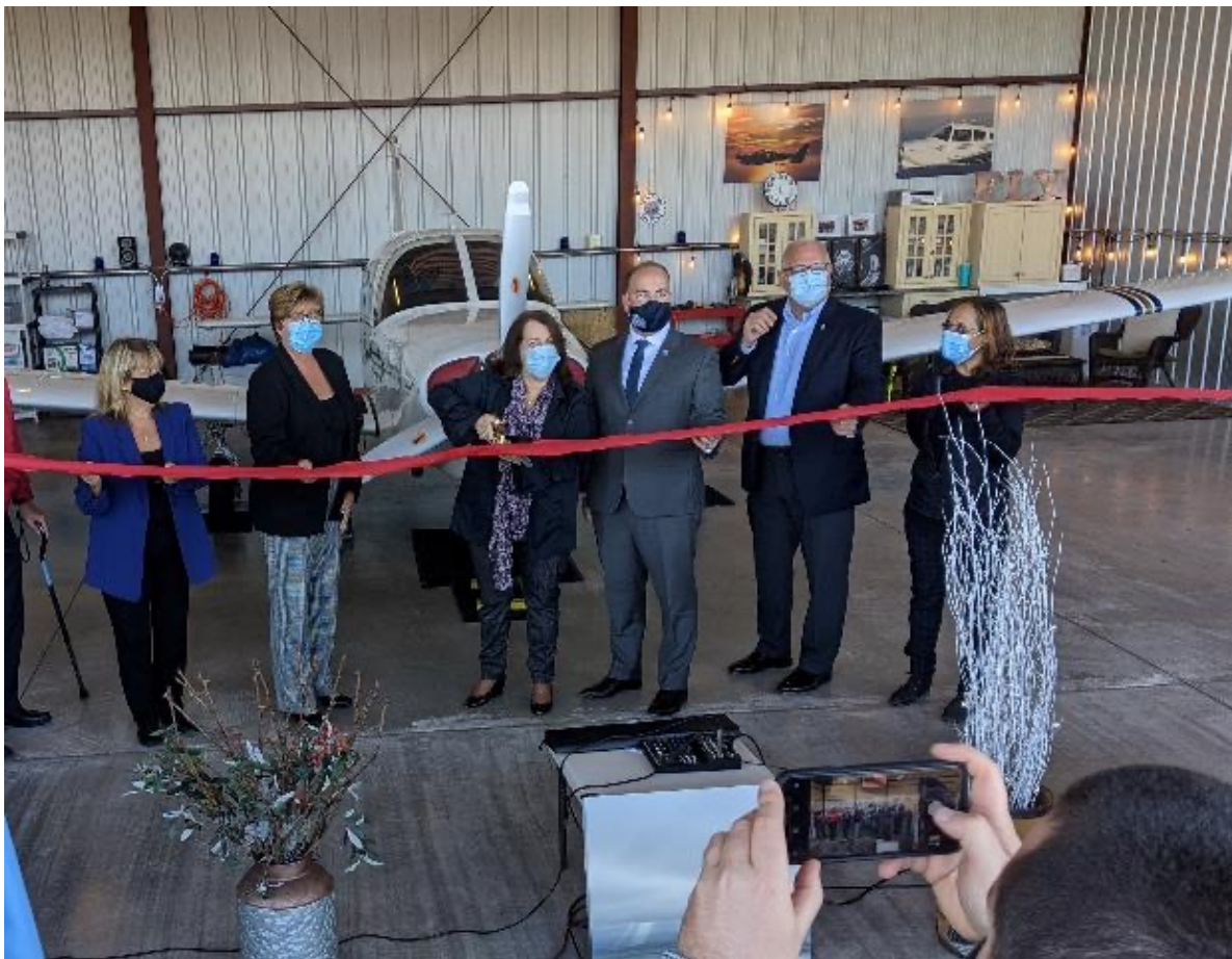
Hangar Completion Ceremony