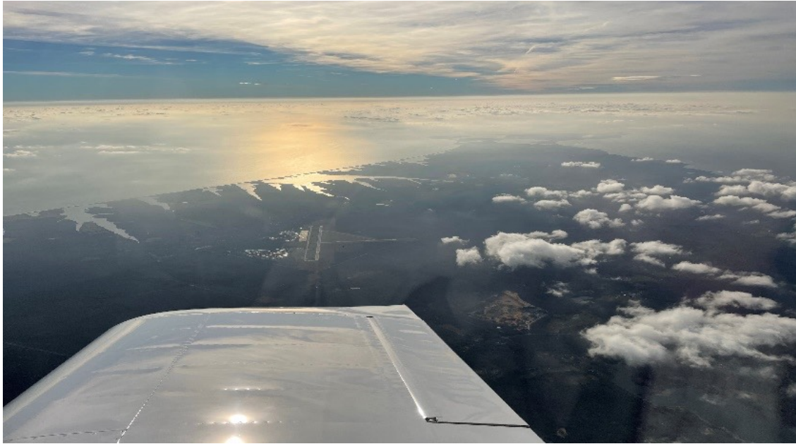
The Vineyard from 7500' .....