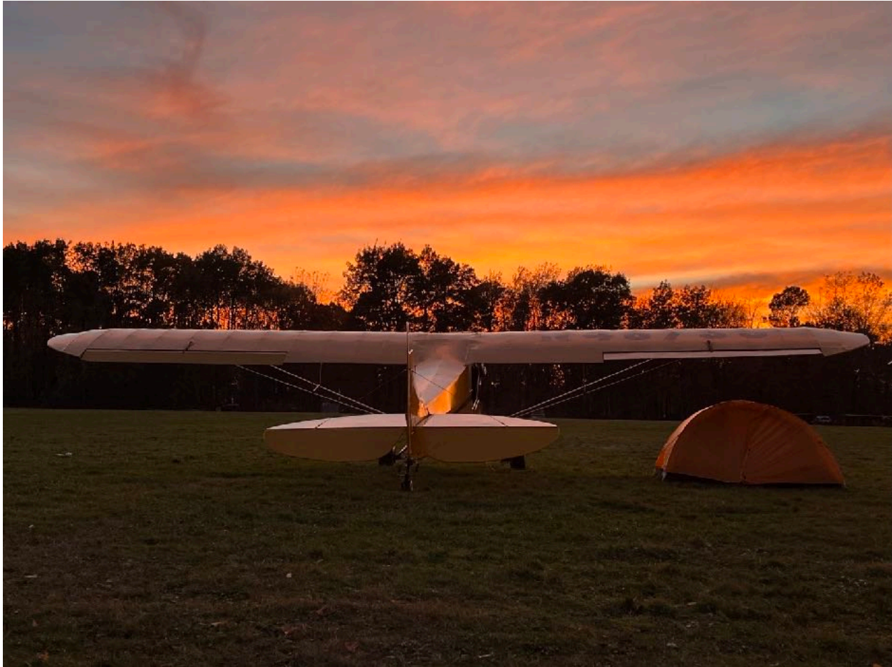
One of the winning photos was from Laurie Strand at N41 MT Tobe 2022 Fly-In