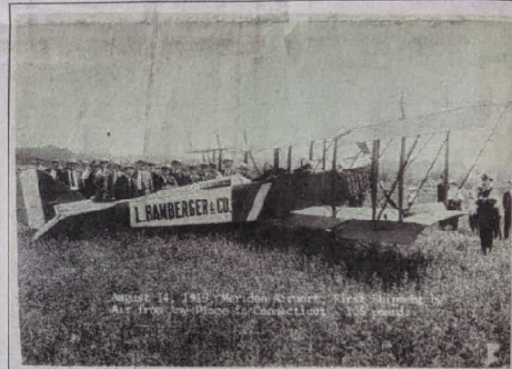
First documented landing at South Meriden Airfield on August 14, 1919.

50th anniversary of man's first powered flight by the Wright brothers in Kitty Hawk NC was celebrated, attended by 20,000 residents. In 1946, multiple landings by a Grumman Hellcat were noted; it turned out that a Navy pilot in training needed to log flying hours and had a girlfriend living in Meriden (they were later married).