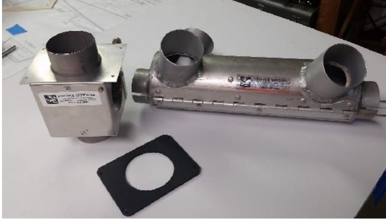
New/unused London & Associates Heat Muff and Fire-wall Airbox with Valve

Various lengths of two inch air hose, both high temp and low temp