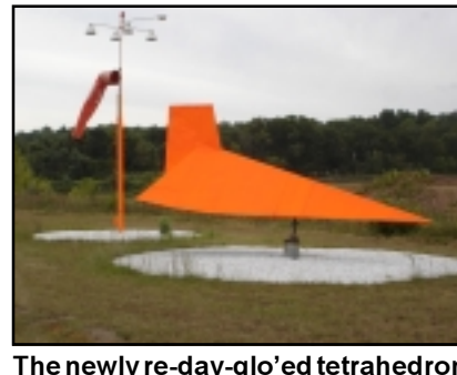
The newly re-day-glo'ed tetrahedron

November is rapidly approaching. This means that we will need to hold an election for Chapter officers for the coming year. We are always seeking "new blood" for the various positions. New ideas are what keep our Chapter flourishing and what better way to get your ideas into action than becoming a part of the team. I encourage you to consider offering your support by letting me know of your interest and availability. I can be reached at (203) 272-9346 for any questions you may have regarding our Chapter or it's operations.